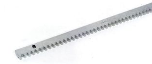
Galvanised rack plus fittings. 4 sections of 3.3 ft (1m) each

Part no. 737816 Shipping Wt 6 lb (2.7 Kg)