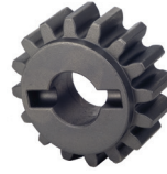
Pinion Z16 for rack

Part no. 490122.1 Shipping Wt 24 lb (11 Kg)