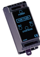
CN 60 E Control unit for safety edge