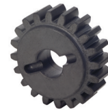
Pinion Z20 for rack