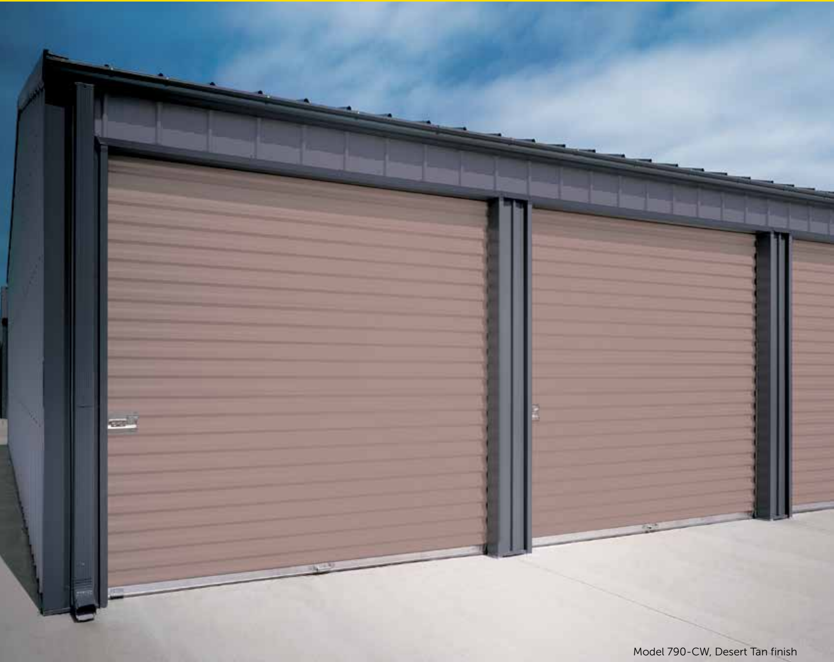
Model 790-CW, Desert Tan finish