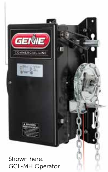
Shown here: GCL-MH Operator

*Cylinder locks and padlocks not provided