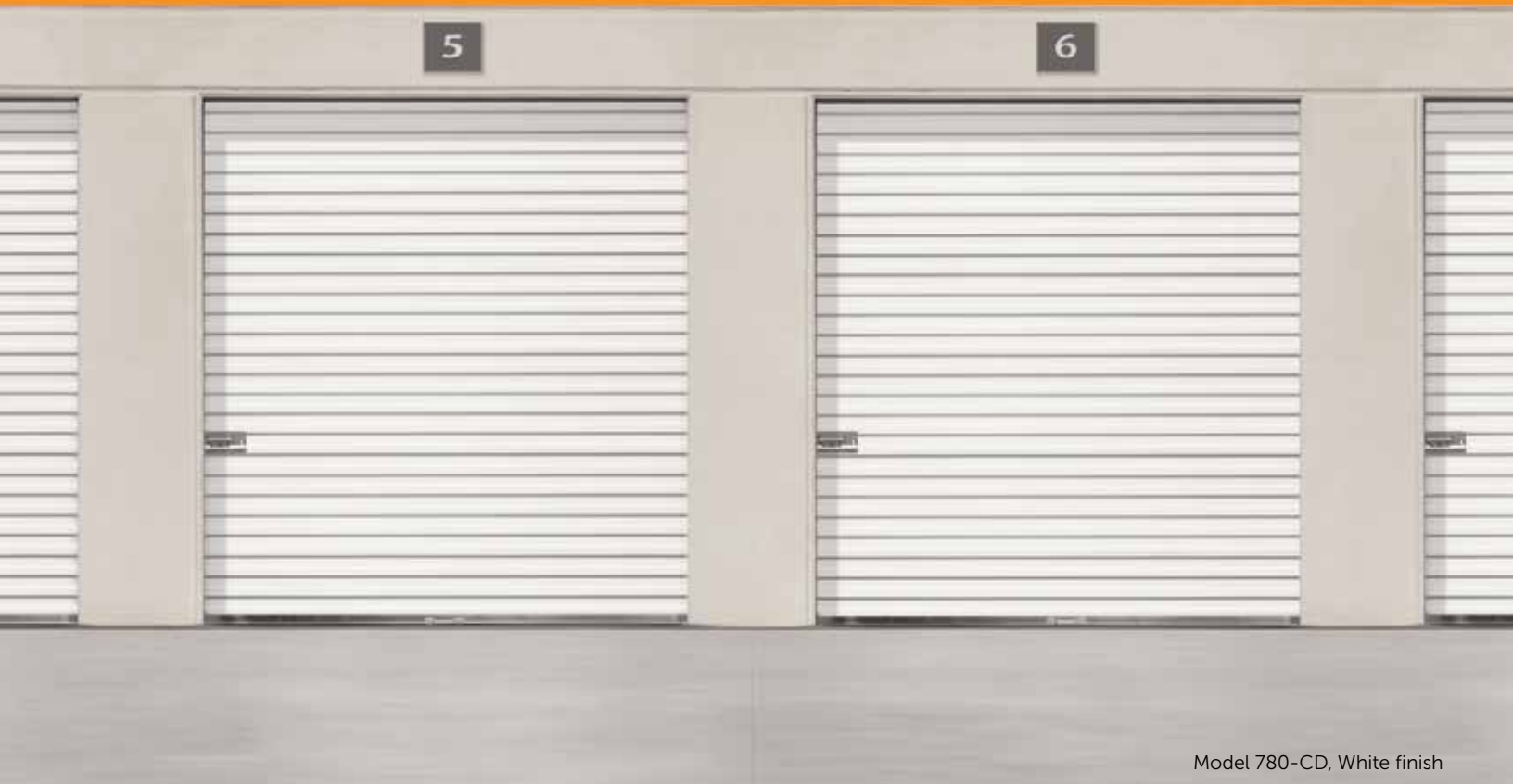
Model 780-CD, White finish