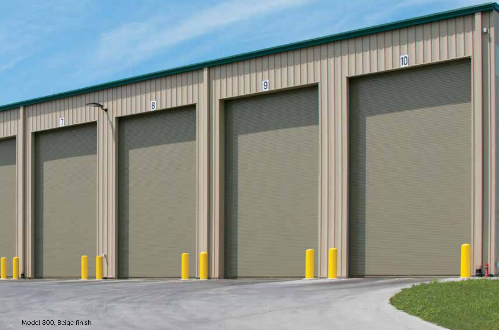
Model 800, Beige finish