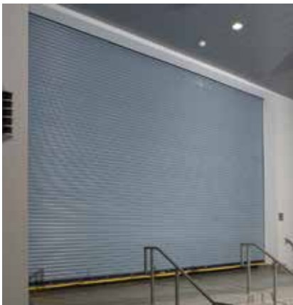
No. 4 slat

Secur-Vent® – Perforated slat provides optimal security and ventilation. Slat consists of \frac{1}{16} " diameter holes offering 17% open area over length of each slat. Available in No. 14 flat slat up to 22' wide x 20' high (available in 20-gauge steel only).