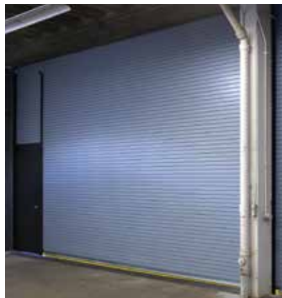
No. 14 slat, shown with a Pass Door